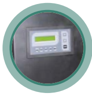
Front LCD Display